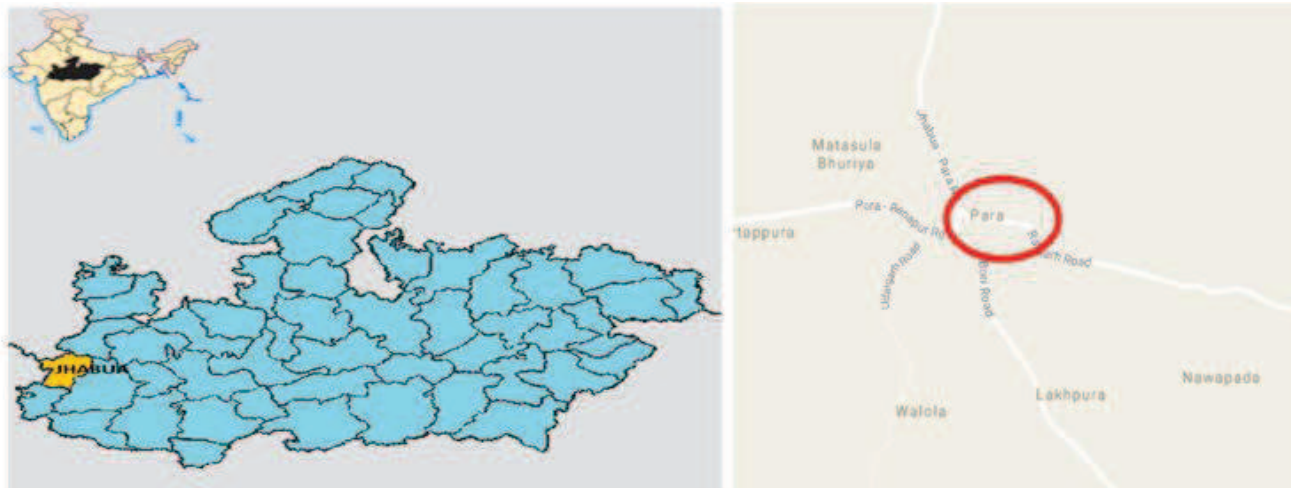
FIG.1. Map showing the sampling locations at Dhamoi Reservoir, Jhabua, M.P

sites, several factors chances of variation in faecal contamination from the landmass, silt and sewage discharge through the rivulets of rivers, possibility of variation in hydrographic and physico-chemical parameters, depth of the water etc. were taken into account.