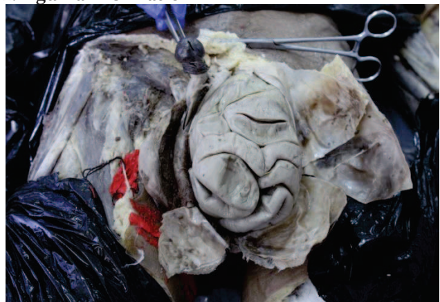
3. Coils Of Intestines